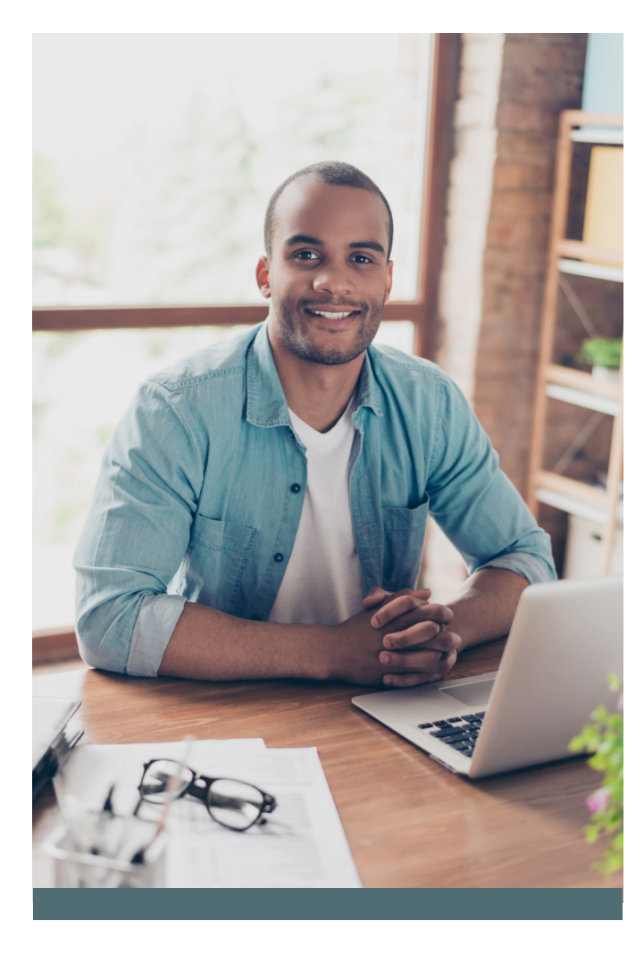
Earn a Deaf/Hard of Hearing teaching endorsement online