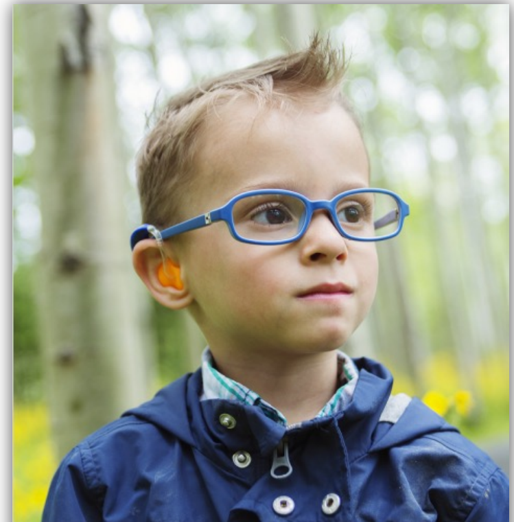
Michigan Communication Plan for Students Who Are Deaf or Hard of Hearing (DHH)